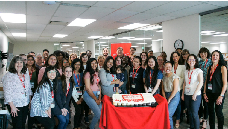
SPRINT Senior Care staff members celebrating a successful accreditation

We take immense pride in our team’s tireless dedication and unwavering commitment to achieving accreditation. Their relentless efforts, and resolute focus on providing safe, essential, and