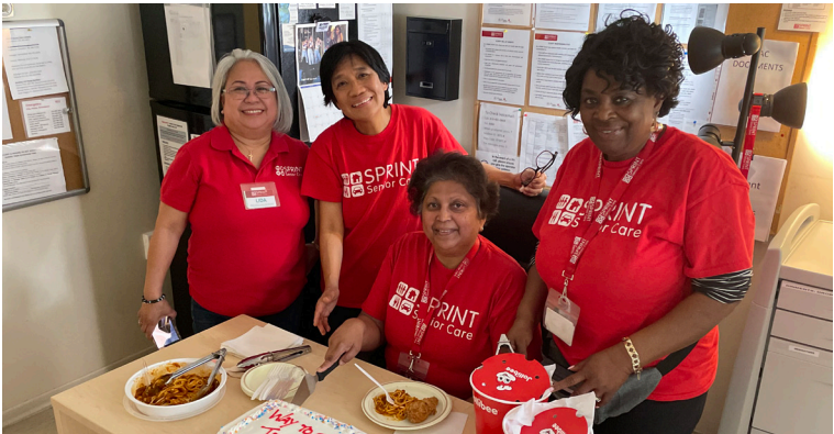
Staff celebrating the success of accreditation

As we celebrate our successful accreditation and the implementation of our refreshed strategic plan, SPRINT Senior Care remains committed to delivering exceptional care, embracing innovation, and uplifting the lives of seniors in our community. We are excited to forge ahead, shaping a future where our clients receive the finest care, our partnerships flourish, and our organization continues to thrive.