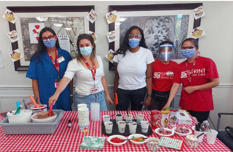
Staff appreciation event

This year marks our 40th anniversary of providing care to seniors and enabling seniors to care for themselves. Since 1983, SPRINT Senior Care has demonstrated unwavering commitment and resilience in providing essential community healthcare and homecare supports. We remain dedicated to being an innovative leader and collaborator in senior-centred care. Our ongoing success and growth are driven by our resiliency, agility, and commitment to collaboration with clients, families, caregivers, volunteers, staff, and stakeholders. As we move through 2023, SPRINT Senior Care is