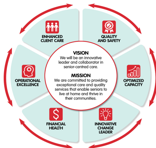
2016-2021 Strategic Plan

We look forward to building on the Pine Villa experience to help direct the work with our North Toronto OHT partners during the 2020-21 year, and to work toward the development of a seamless and integrated health care system that is centred around the needs of clients and caregivers.